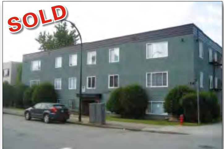
The Kaleden, South Granville 1015 West 13th Avenue, 11 Suites Totally renovated, excellent suite mix 5.2% Cap Rate, Asking $3,075,000