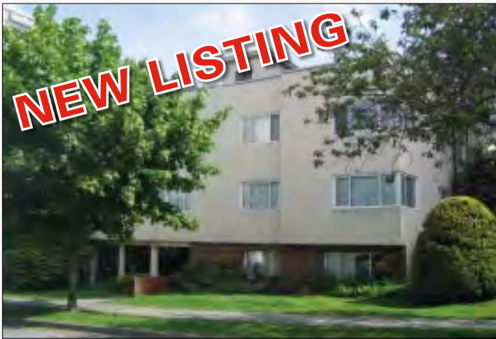
19 Suites, West End 1775 Pendrell Street, Vancouver English Bay location, penthouse suite, good suite mix Asking $4,449,000