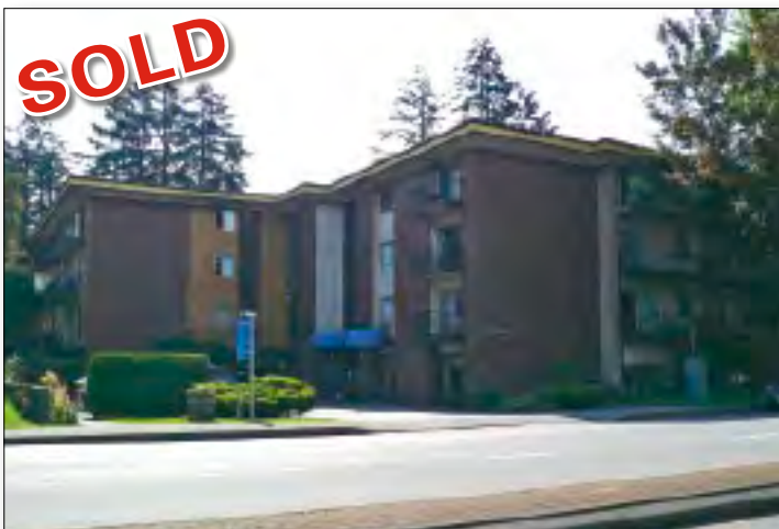
57 Suites, Metrotown 6550 Nelson Avenue, Burnaby Steps to shopping, secure parking, elevator Asking $6,500,000