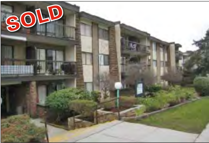
132 Suites, Coquitlam 540-542 Rochester Avenue (2 complexes) Walk to SkyTrain, secure parking, 2.19 acre site Asking $15,500,000