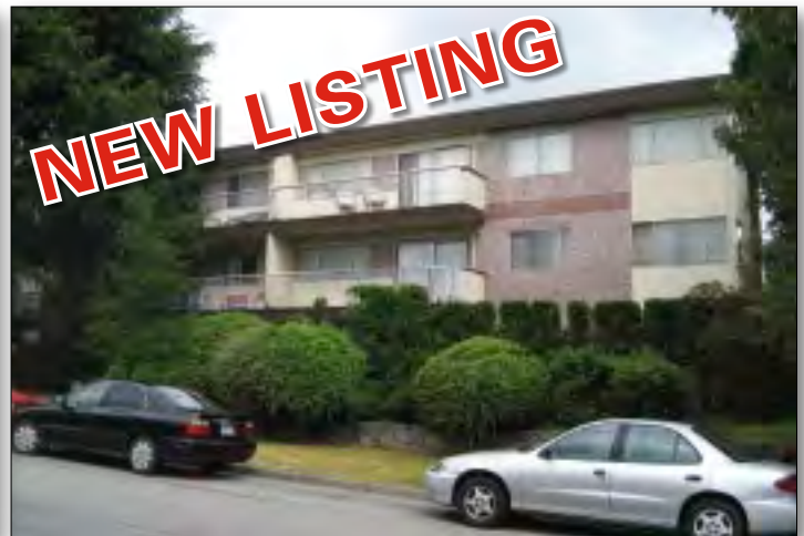
23 Suites, Marpole 8666 Heather, Vancouver Near SkyTrain, balconies, some views Call for price

Both properties above, which are situated directly across the street from each other, can be purchased as a package.