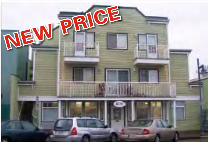
7 unit strata building, Steveston 12040 2nd Avenue, Richmond 6 townhouse & 1 retail unit, built 1996 Private entrances & garages for suites, Asking $2,095,000