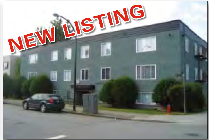
The Kaleden, South Granville 1015 West 13th Avenue, 11 Suites Totally renovated, excellent suite mix 5.0% Cap Rate, Asking $3,195,000