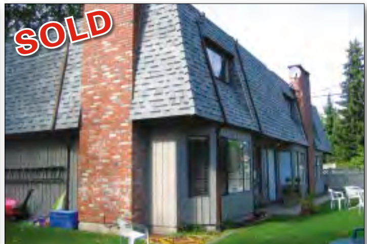
Development Site, North Vancouver 1285 East 27th Street, Triplex Asking $1,095,000