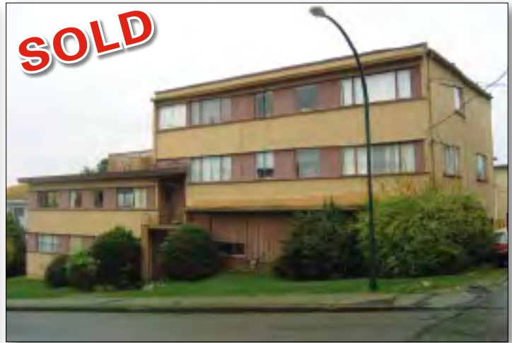
The Marilyn, Kitsilano 1622 Vine Street, 8 Suites Prime location, city & mountain views Asking $2,795,000