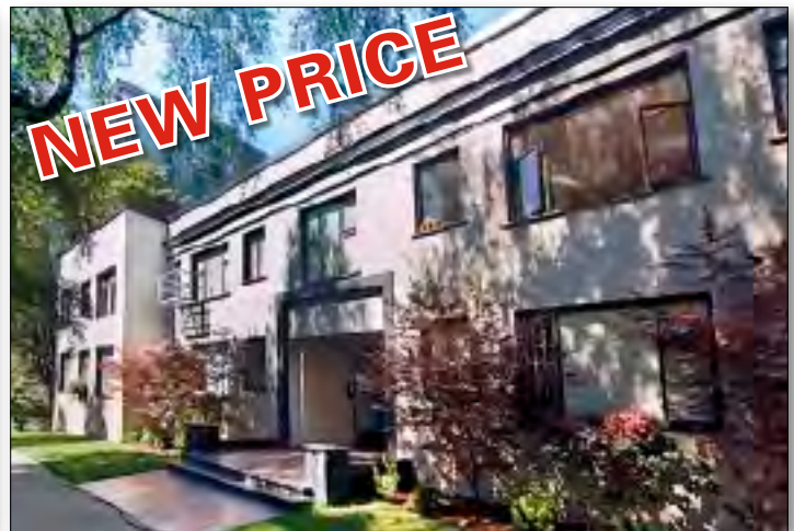
19 Suites, West End 935 Jervis Street, Vancouver (block from Robson St) Over $1M in renovations, beautifully restored classic building 5.0% Cap Rate, Asking $5,495,000