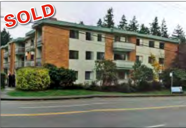
Haighton Manor, White Rock 1580 Overall, 57 Suites Pristine condition, centrally located 4.9% Cap Rate, Asking $7,350,000