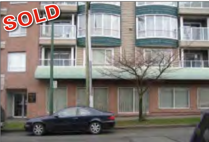
4 retail strata lots, Mount Pleasant 785 West 16th Avenue, Vancouver Part of mix-use residential development 2012 sq. ft., Asking $850,000