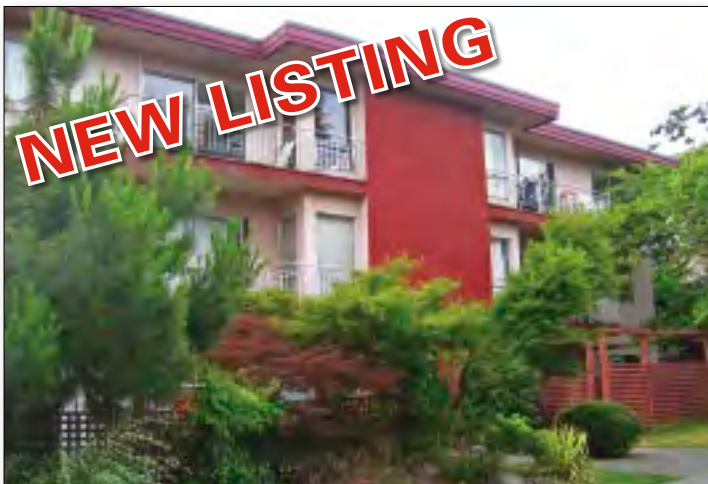
23 Suites, Marpole 8669 Heather, Vancouver Near SkyTrain, balconies, some views Call for price