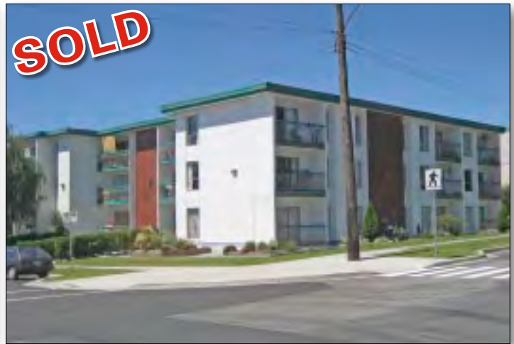
28 Suites, Central Lonsdale 210 West 16th Street, North Vancouver Lot 120' x 140', excellent suite mix, well maintained 3.9% Cap Rate, Asking $4,695,000